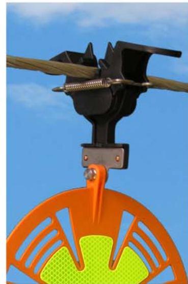
Part Number 1097 (6-16 Clamp)