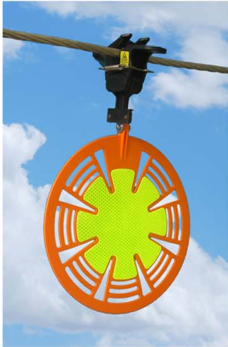
Part Number 1096 (10-70 Clamp)